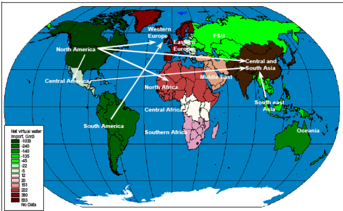
Fig. 3. Virtual water trade balances of thirteen world regions over the period 1995-1999. The arrows show the largest net virtual water flows between regions (>100 Gm3).