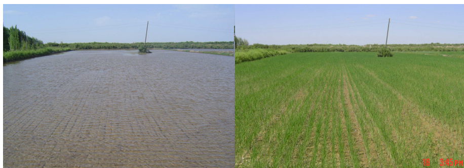
Picture3: Irrigation (left) and crop germination (right) on a laser leveled field

While the land may appear level with this technique, during the irrigation period topographic variations become visible, revealing an uneven distribution of irrigation water. Undulated land conditions resulting from this method higher production costs as the application efficiency of irrigation water depends strongly on the topography of the field. For example, in a field where the topography varies by 10 cm from the highest to the lowest points, an additional application of 1000 m 3 water per ha is needed to obtain a similar soil moisture level at the most elevated spots. In addition, when farmers apply excessive amounts of water to compensate for topographical variation, lower elevations are prone to water logging—a very serious and common phenomenon in Uzbekistan. Non-uniform water distribution similarly enhances differences in soil salinization within the same field. Conventional tillage practices, such as land leveling, often move the soil in one single direction, which over time may contribute to uneven soil surfaces. Fields that are unlevelled show an uneven cropping pattern, have a higher rate of weeds, and display uneven maturation rates—all factors which lead to yield losses.