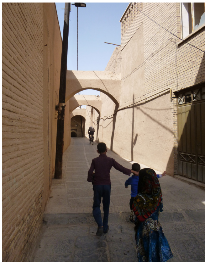
In the picture: A photo from a blog post by Irit Eguavoen .