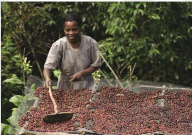
For a "social person" biodiversity has a value of its own.

In order to answer this question, researchers at ZEF and members of the CoCE project conducted an analysis of the economic value of Coffea arabica 's genetic resources in the Ethiopian highland forests. The valuation is based on an assessment of the potential costs and benefits of using Coffea arabica 's genetic information in breeding programs for enhanced coffee cultivars. The study considers the breeding of three types of enhanced cultivars: increased pest and disease resistance, low caffeine contents and increased yields. Costs and benefits are compared for a 30-year discounting period and result in an estimated net present value of coffee's genetic resources of between US$ 0.42 billion and 1.46 billion. This estimate is prone to considerable uncertainty and only gives a first indication of this particular service supplied by coffee forests. Note that the forests also provide a whole range of other services, such as the supply of timber and non-timber forest products, river water retention, carbon sequestration and nature conservation. The study only demonstrates the high economic value of wild coffee's genetic resources. However, as demonstrated by the case of the Ethiopian coffee forests, calculating these economic values will in itself not be sufficient to conserve the genetic resources, since biodiversity loss is also a consequence of broader institutional and political failure.