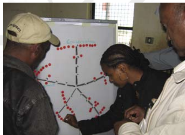
The project assessed the economic value of wild coffee's genetic resources.

however, perceive the situation differently: only if society values these genetic resources highly enough will it invest in conservation. But even if society is aware of and