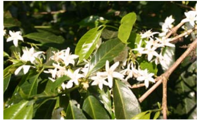
Forests provide a whole range of eco-services.

Accepting that biodiversity loss is also a problem of institutional and political failure requires a re-thinking of how valuation methods are applied to elicit the value of biodiversity. Apart from speculating on the reasons why different actors show no interest or willingness to pay for conservation, we take a self-reflective view and consider the value of economic valuation for biodiversity.