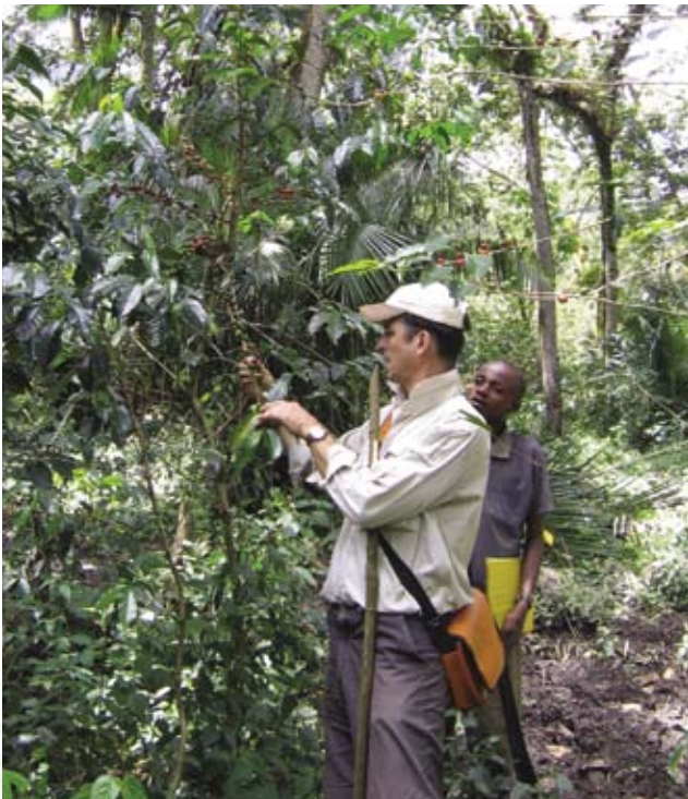
Certification needs a trustful cooperation among the stakeholders.

have to be fulfilled to make certification a successful tool, especially when it is simultaneously supposed to meet socio-economic as well as ecological goals: