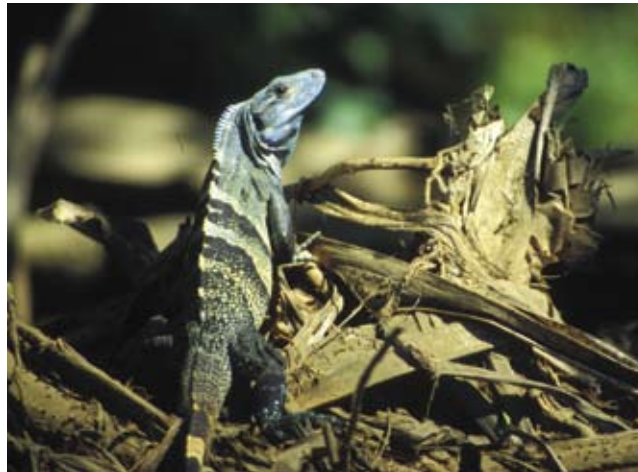
The Black Spinytail Iguana (Ctenosaura similis) prefers arid habitats with tree populations.