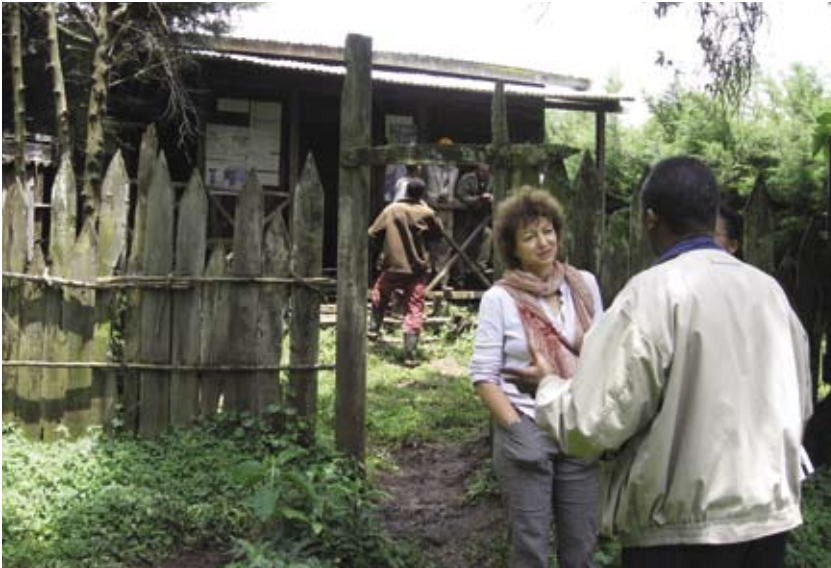
Trans-disciplinary research involves local stakeholders.

The CBD and the research programmes which are based on it explicitly demand such contributions. The German Federal Ministry of Education and Research (BMBF) has set up corresponding research programmes, such as the BioTeam programme: "Biosphere Research – Integrative and Application-Oriented Model Projects". ZEF is leading one of these model projects: CoCE – "Conservation and use of the wild populations of Coffea arabica in the montane rainforests of Ethiopia". The aim of the project is to support the implementation of the CBD in Ethiopia. We would like to illustrate a few special features of this type of research using the example of the CoCE project.