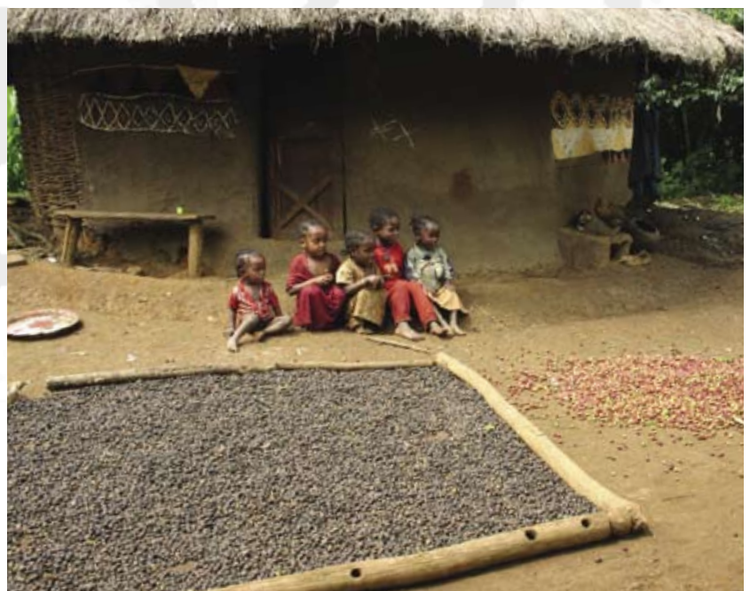
Certified goods are often produced by smallholders in rural areas.