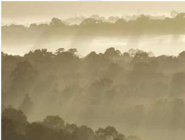
Early morning mist above Kakamega Forest.

Heavy wafts of early morning mist are slowly rising from the ample forest area as an orange sun makes its way up the horizon. We got up a little earlier today to climb Buyangu Hill and catch a glimpse of a tropical dawn's play with light and vapor. Before us lies Kakamega Forest: It is the only remaining patch of Kenya's Guineo-Congolian rain forest. Famous for its rich diversity of animal and plant species, it is home to about 330 bird species, 400 species of butterflies and over 390 species of vascular plants, many of them endemic. Its rich biodiversity