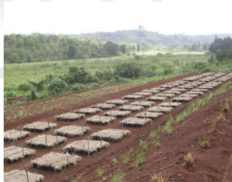
Field experiments on coffee in Ethiopia.

The overarching aim of CoCE is to promote the establishment of a protected area in the Ethiopian forest region. In consultation with the stakeholders, the project chose the form of a UNESCO biosphere reserve as the most promising approach. This combines the preservation of the forest in zones which are particularly worthy of protection with the careful use and targeted – economic and social – development of other zones. Once this form had been decided, the further project aims were put into concrete terms and focused towards the biosphere reserve: For example, the development of management guidelines for the coffee forest in the various zones, or certification mechanisms for coffee produced in the biosphere reserve (see article by Till Stellmacher in this ZEF news, P. 5).