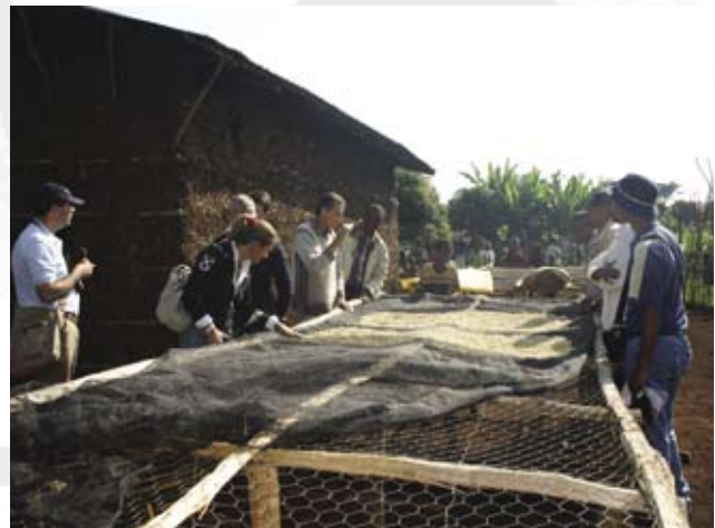
Representatives of the coffee industry visiting the birthplace of its commodity.

Management concepts aiming at the simultaneous conservation and use of natural resources might create conflicts. In Ethiopia, all forests are nationalized. Most coffee forest areas are located in so-called National Forest Priority Areas. Here, local forest users have limited rights of access and use, which conflict with traditional property rights. The project's research group focusing on