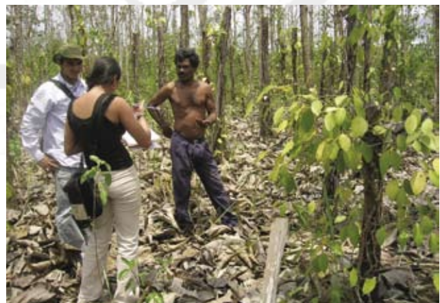
The multi-criteria analysis tool assesses biodiversity in agroforestry systems.