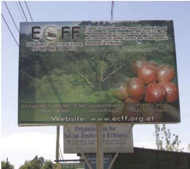
Local brand: ECFF.

and formal institutional levels. Such institutional links are, however, necessary to develop effective concepts for the conservation and management of natural resources.