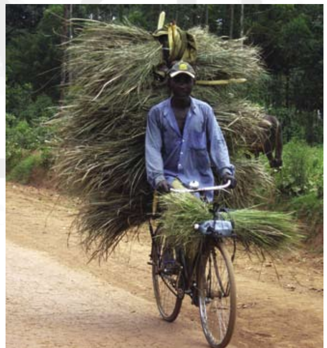
Thatching grass harvested in forest and transported home.

Considered as an economic undertaking, forest conservation involves the use of resources such as land and cash as well as the generation and distribution of benefits. From an economic perspective, these resources ought to be allocated in a way that generates maximum net benefits to society. Kakamega Forest generates substantial benefits to the local communities and since the majority of these benefits are not marketed, they are 'priceless'. However, this does not mean that they are without economic value. Using state-of-the-art techniques, ZEF scholars have captured these values and translated them into monetary terms, a language that policy-makers tend to understand best. The estimated economic value of extracted products in the year 2005/06, for example, averaged US$72/ha. However, these benefits are offset by the forgone opportunity of using the forest land for farming, which averages about US$148/ha/year. Conservation is a losing business for the local people when