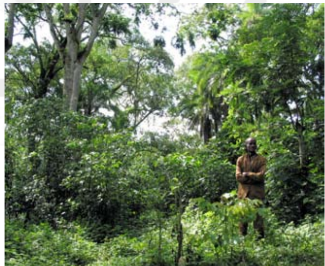
The Atlas includes information on Ethiopia's forest cover.