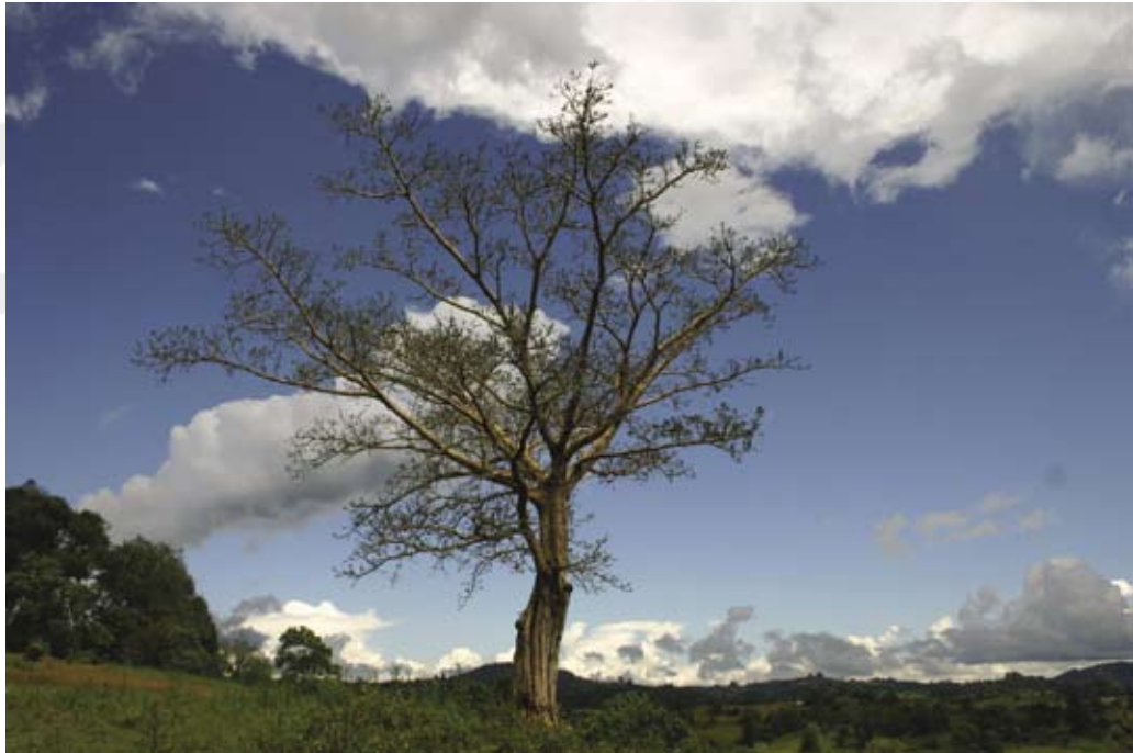
Many branches, one goal.

described above requires more intensive co-ordination and more time for the integration of research results from the various disciplines and for internal and external communication, as well as for analyses of the situation of and strategic relations with stakeholders. This cannot be achieved by merely involving experts in communications and stakeholder management. Every single person involved in the project must put aside time and funds for the tasks of integration, management and communication in his or her particular field. Instead of the normal 5–15% of the project budget earmarked for those tasks, one must think