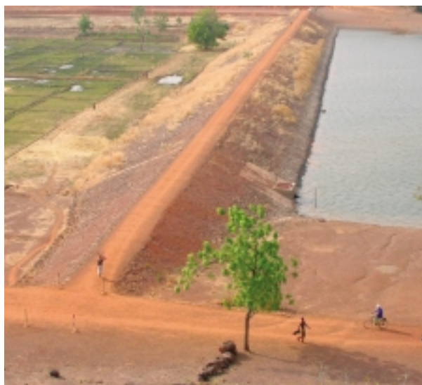
A micro-dam project in Burkina Faso.

In what way do the farmers benefit from the opportunities created by the dam, such as crop-growing in the off-season or fishing?