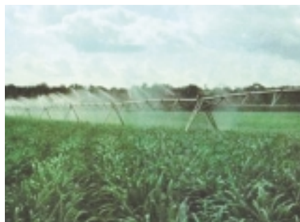
Testing of an irrigation model in Brazil.

The model can be applied to situations all over the world as long as input data are avail-