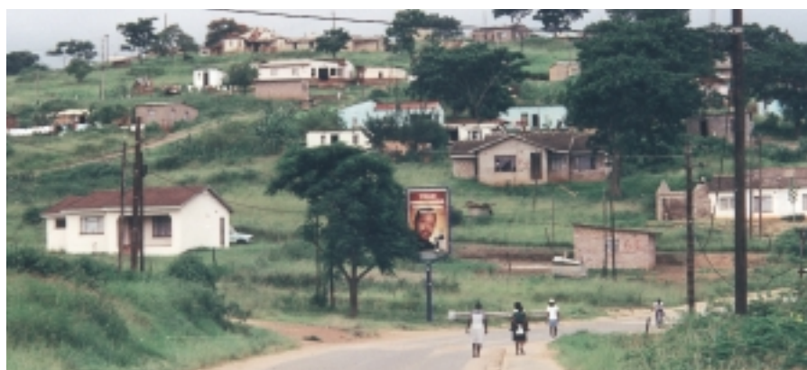
A suburb in Kwa Zulu/Natal.

However, a forthcoming PhD thesis at ZEF questions this widespread assumption. The main objectives of this study are to analyse and understand collective violence in the local arena in KwaZulu/Natal after 1994. So far, only very few research projects have investigated violent action at local level, so that there is still a need for in-depth studies on the microcosms of collective violence. In the course of one year of fieldwork in KwaZulu/Natal it became evident that despite a decrease in media coverage and public attention, a substantial number of people had been killed in the post-apartheid era. Recent figures put the number of casualties at about 2,000