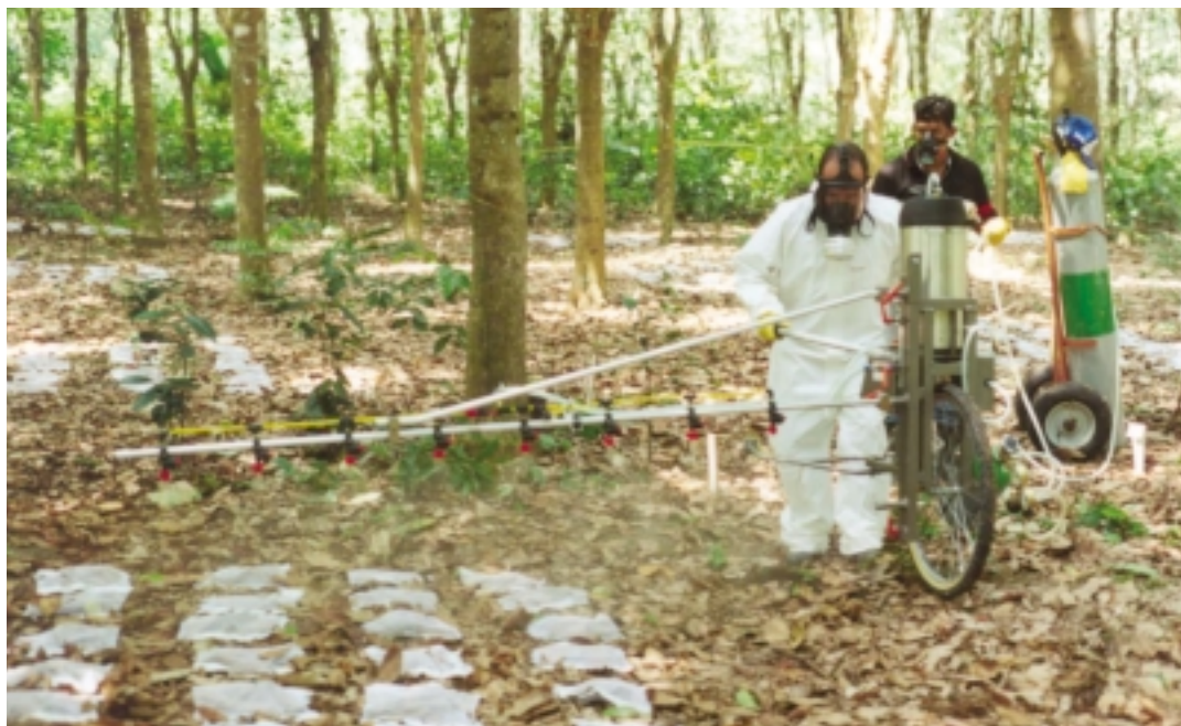
Testing the effects of pesticides should take place under tropical conditions.