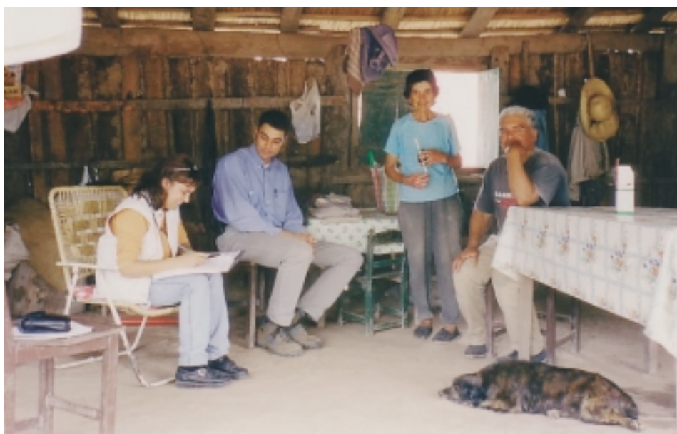
Argentine farmers participating in a survey.

Since there is concern that GM technologies might be biased towards large-scale agricultural producers, the impact was also examined for different farm sizes. In Argentina, large farms tend to use more chemical inputs than smaller ones, so it is not surprising that they also realize bigger pesticide savings through Bt varieties. For cotton yields, however, the opposite is true. Many smallholders do not use insecticides at all, so they suffer significant pest-related crop losses in conventional cotton. Econometric models show that the net Bt yield gain is 17% for average large-scale growers, whereas it is around 42% for small farms. Also, total gross benefit per hectare of Bt cotton is higher for smaller than for larger farms. Similar results have been observed