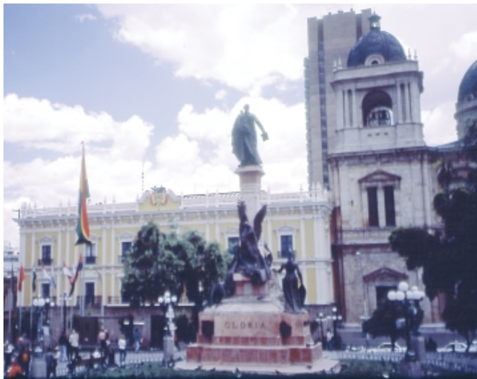
Presidential palace in Bolivian capital La Paz.

organisational form of the Supreme Court of the United States – not its meaning and relevance – has lost in influence as a role model in Latin America. A comparison of the reforms in public law in Latin America has shown that continental European models are increasingly being followed. Since 1980 six countries of Latin America have created new specialised constitutional courts (tribunales constitucionales) according to Spanish or French models, for example in Chile, Peru and Bolivia. During the same time, six more countries introduced court senates specialised in cases regarding constitutionality (salas constitucionales) within existing Supreme Courts. Only in six countries – among them Argentine and Uruguay – were traditional Supreme Courts of the type found in the United States kept as the sole organs for constitutional control.