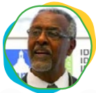
Gebisa Ejeta Distinguished Professor of Plant Breeding & Genetics & International Agriculture, Purdue University