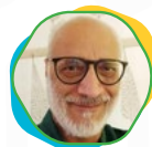
Ashok Gulati Infosys Chair Professor for Agriculture, Indian Council for Research on International Economic Relations (ICRIER)