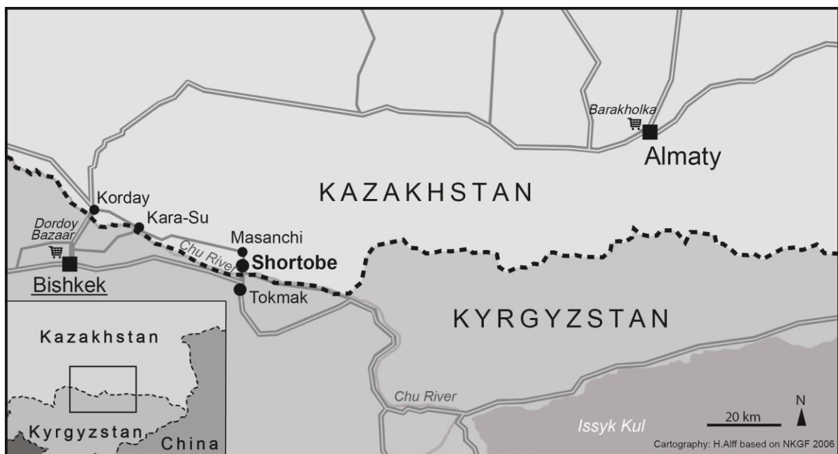
Figure 3: Localisation of the second case study area in the Chu river valley demarcating the state border of Kazakhstan and Kyrgyzstan. Shortobe is the centre of a predominantly Dungan-populated cluster of villages.

Socio-cultural and economic connectedness to China evokes different representations in the case of the Dungans 10 , a group of about 56,000 Chinese-speaking Muslims predominantly living in a cluster of compact settlements in Zhambyl oblast’ of Southern Kazakhstan (Agenstvo po statistike RK, 2012). The village of Shortobe, about 200 kilometres away from Almaty, although connected to Barakholka in multiple ways, served as the site for three weeks of field research (2012-14) in this case study (Figure 3).