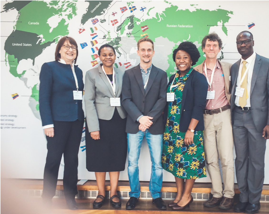
International delegates of the GBS 2018

and produces large amounts of waste and severe environmental problems. Transforming the African bioprocessing sector so that it adds value to the primary production and converts waste to valuable products in a resource efficient and environmentally friendly manner will be central for emerging African bioeconomies.