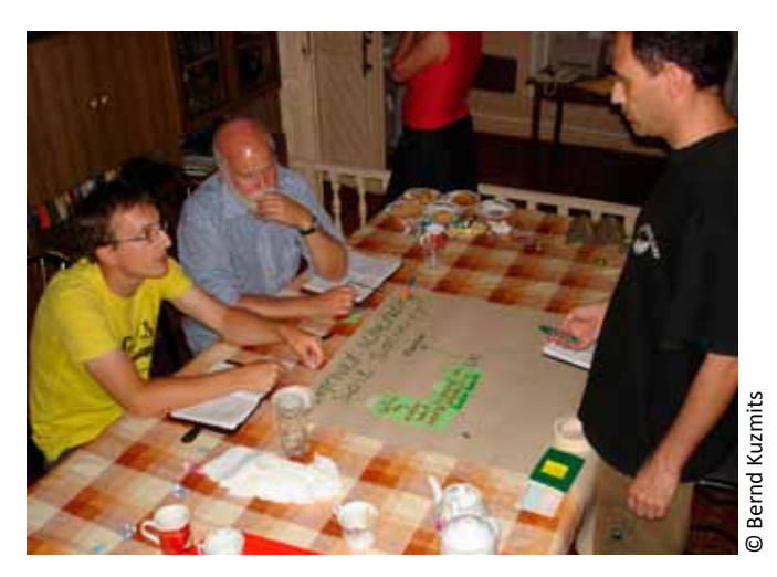
Brainstorming on the roadmap in the salinity assessment team