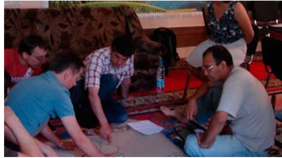
Venn diagram analysis of stakeholders