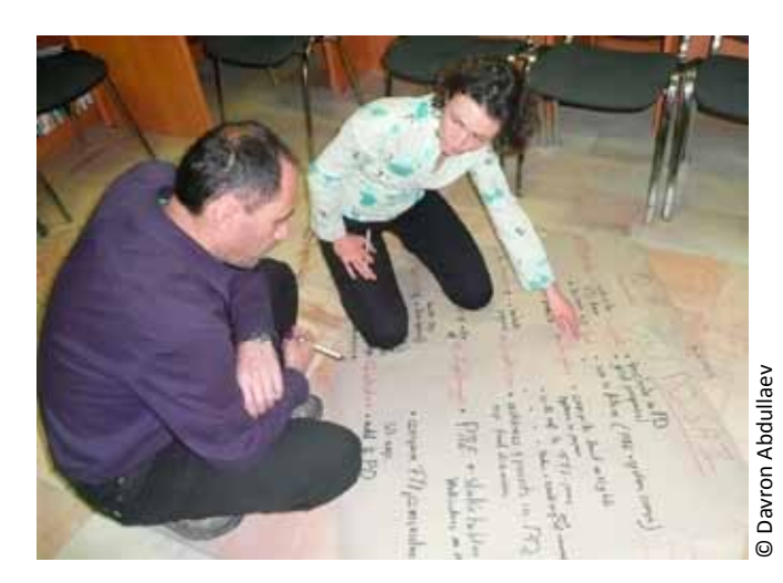
Visualising main issues raised

Livelihood and system benefits (long-term) Positive changes in regional landscape Appreciation and credit for project increased