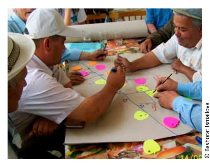
Canal mapping by WUA members

Having prepared itself for the main design steps and possible M&E components, the FTI team plays a double role in: i) helping stakeholders define their M&E needs and related activities by asking systematic questions step by step; and ii) defining, if needed, its own (further) learning needs and related M&E activities complementary to those of the stakeholders.