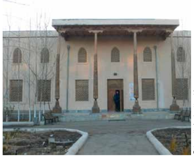
Project office at the compound of Urgench State University, Uzbekistan