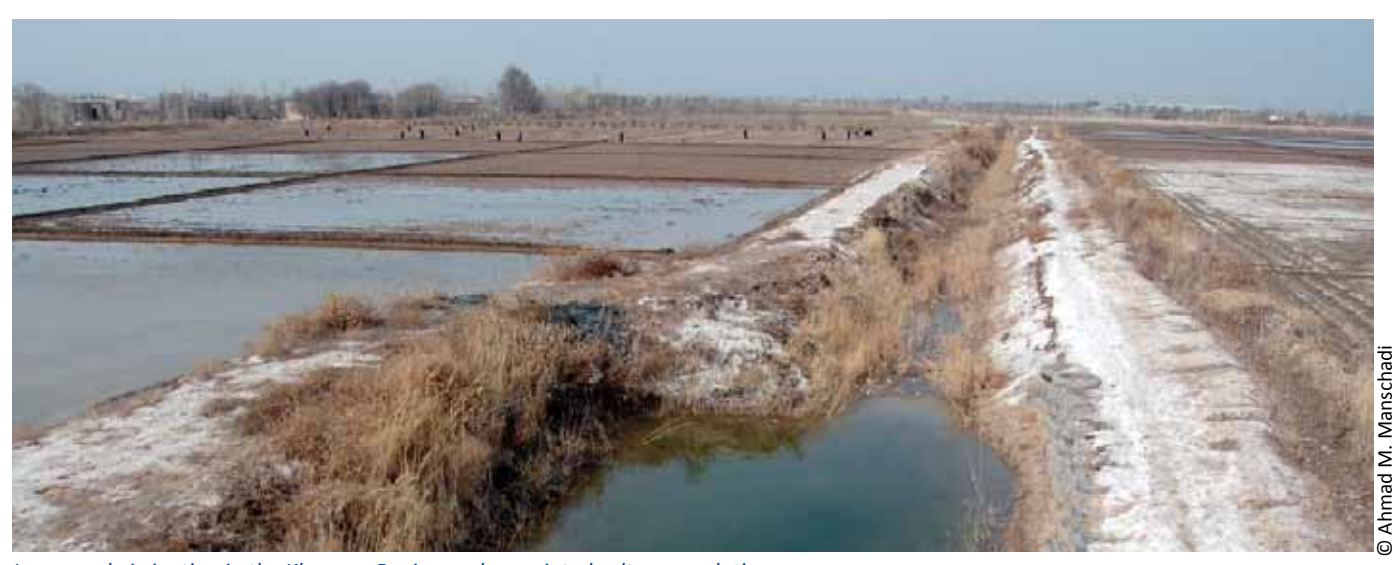
Large-scale irrigation in the Khorezm Region and associated salt accumulation

The target yields that a farmer must get from the assigned piece of land are also pre-determined, and it is the farmer's obligation to achieve or exceed that target. To help the farmers achieve the prescribed targets, the government provides a proportion of production costs in advance through