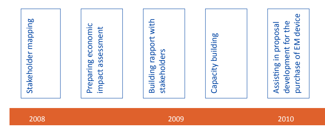
Figure 1: Roadmap of the salinity assessment team

another team member to facilitate team discussions and create an open, motivating and encouraging environment. In cases where the team leader found this difficult, it proved helpful to request one of the team members or the FTI coordinator to moderate certain team discussions.