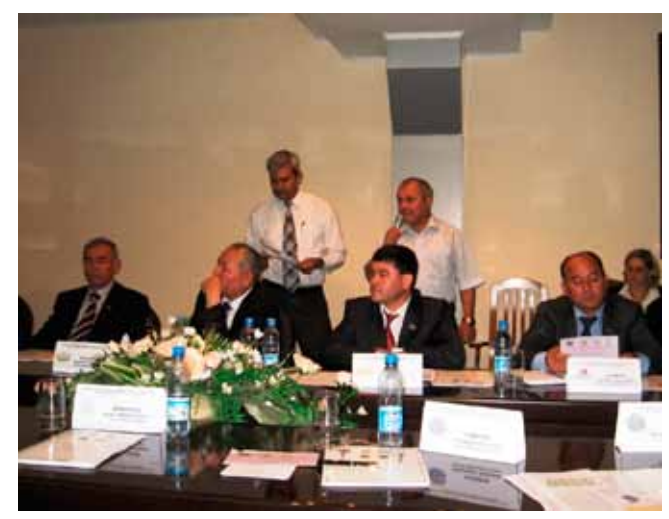
Symposium for the Uzbek Parliamentary Committee on Agriculture