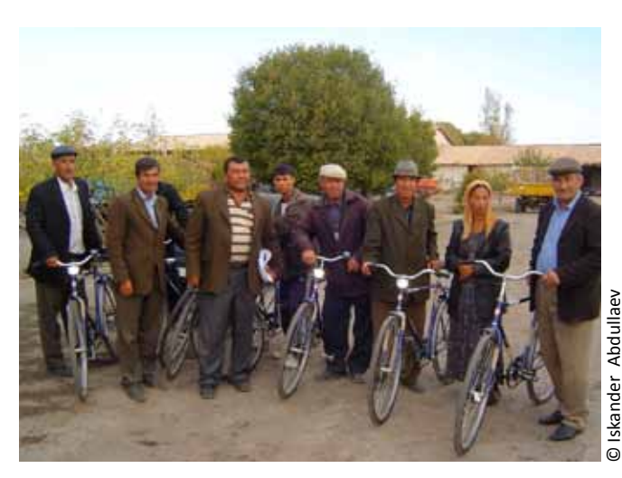
Bicycles improve the visibility and outreach of WUA staff

The WUA team proposed to improve farmers' ownership of the WUA through social mobilisation and training. However, WUA stakeholders perceived having an own office and means of transport as prerequisites for "having a face" and recognition by the community. The WUA team, after a series of discussions about the potential benefits and other modalities, agreed to contribute some funds for refurbishing the office of the WUA to increase its visibility within the community. The WUA requested materials from the project and decided to cover the labour costs itself.