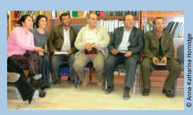
Members of the WUA core group joined all FTI training events